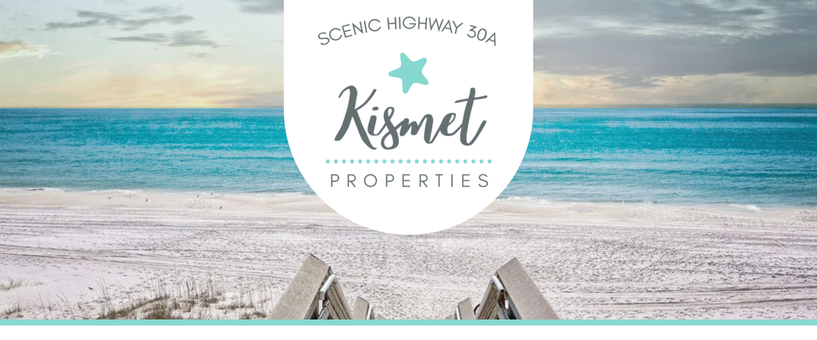
Family Owned, Boutique Vacation Rental Management